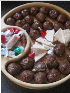
Christmas Candy Fun Make and Take Chocolate Candy Sat, Dec. 23 | 1 p.m.