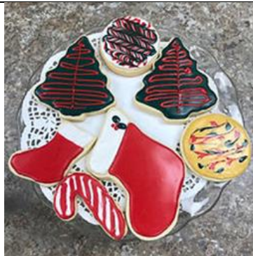
Teens and Adults Cookie Decorating w/ Royal Icing Sun, Dec 10 | 1 p.m.